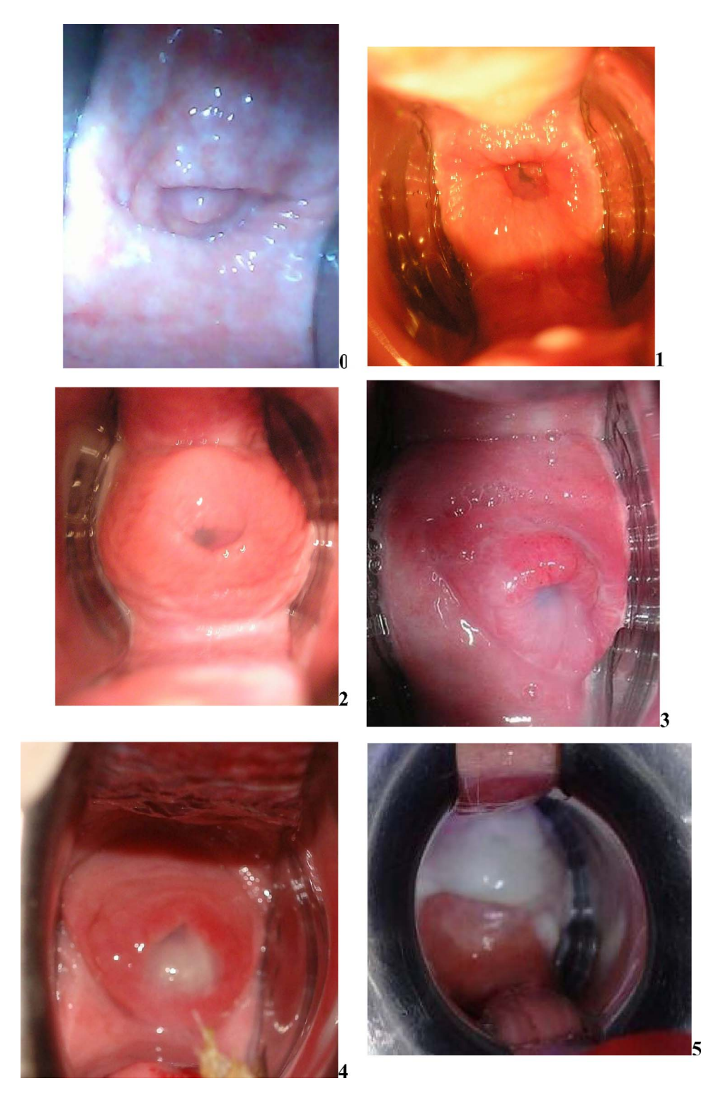
Fig. 2. Observations on the cervical mucus discharge in the cervical os of the goats. 0–no discharge, no estrus; 1–crystalline mucus; 2–crystalline/striated mucus; 3–striated mucus; 4–striated/caseous mucus; and 5–caseous mucus. See the text for details of mucous categories.

ovarian follicles \ge 3 mm were recorded. The day of ovulation was defined as the day on which an identified preovulatory follicle(s) was no longer detected.