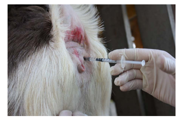
Fig. 1. Cloprostenol administration by latero-vulvar route. A 1 mL syringe coupled to a 0.7 mm \times 25 mm needle was used for each animal.

A total of 104 dairy goats (15 Alpine, 38 Saanen and 51 Toggenburg), of eight months to five years old, were used in this study. Goats were kept in an intensive management system, and grouped according to physiological status and milk production in pens housing 10 to 12 goats each (2.5 to 3 m<sup>2</sup> per animal). Goats were fed corn silage and Pennisetum purpureum K. Schum as forage, and balanced concentrate supplement (soy bean, corn and mineral nucleus based mixture). Non-lactating multiparous and nulliparous goats received daily rations of 0.5 kg of concentrate/goat (homemade mixture with 16% crude protein and 68% total digestible nutrients - (TDN) and 4.0 kg of chopped elephant grass/goat. Lactating goats received daily rations 1.5 kg of concentrate/goat (homemade mixture with 22% crude protein and 69% TDN) until the attainment of daily milk yields of 3 kg/goat plus 0.33 kg of concentrate for each additional kg of milk produced and 4.0 kg/goat of corn silage. Mineralized salt licks (Salminas Goats<sup>*</sup>, Nutriplan, Juiz